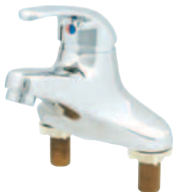
B-2711 Single Lever Faucet