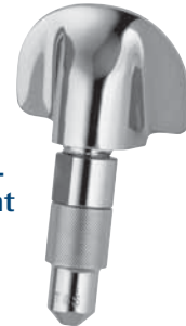
B-1092 Vandal- resistant Shower Head