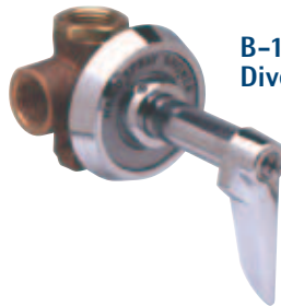
B-1097 Two-way Diverter Valve

Additional technical information and model specs for Pressure Balancing Shower Valve models are available online at www.tsbrass.com