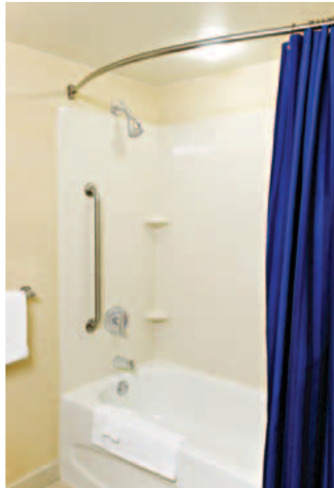
B-3200/B-3300 Pressure Balancing Shower Valve, 2.5 GPM Shower Head and Tub Spout

And with T&S's Reliability Built In™ , you can be assured of owning an outstanding shower product with T&S established quality and durability.