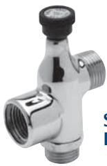
SQ-0100 Diverter Valve