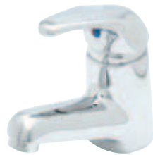
B-2701 Single Lever Faucet