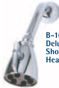
B-1091 Deluxe Shower Head

* Compatible with the B-3200/B-3300 series only