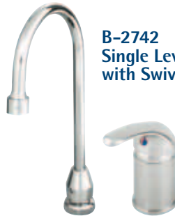
B-2742 Single Lever Faucet with Swivel Gooseneck