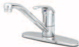
B-2731 Single Lever Faucet