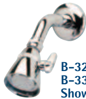
B-3200/ B-3300 Shower Head

Our B-3200 and NEW B-3400 series shower valve packages are designed for installation with 1/2" sweat connections, allowing for easy sweating of copper pipe.