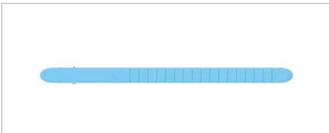
Strap 10/Pack Code: AM0620