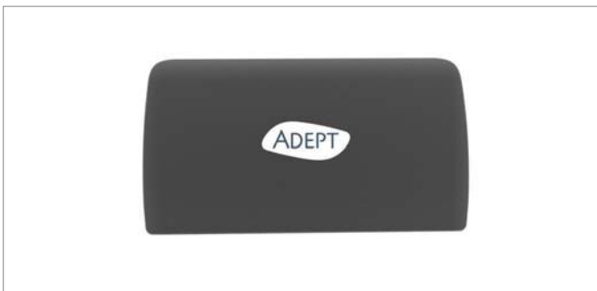
X-Ray Shield Code: AM0630