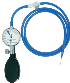
Manometer with 1m (40") connecting tube