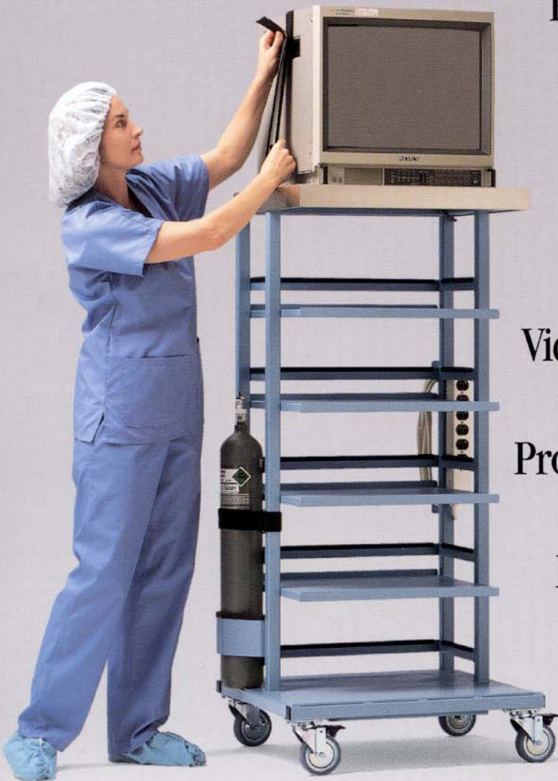
The Promedica Model 110