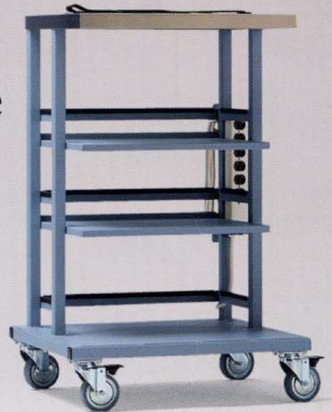
The Promedica Model 55